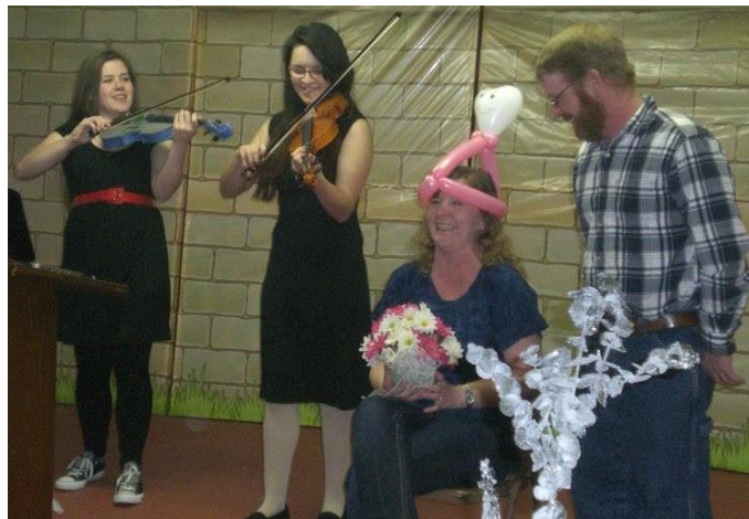
Valentine Banquet Entertainment