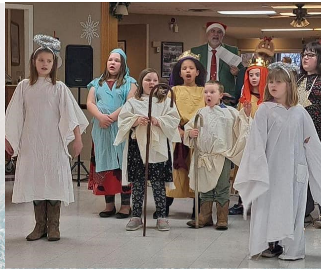
The children had the opportunity to go Christmas Caroling at local nursing facilities.