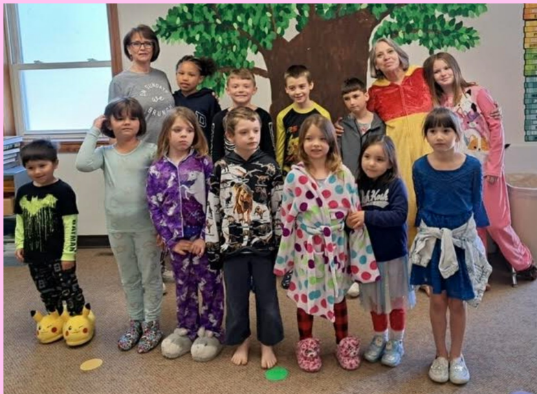
2024 PopTarts, PJs, & Praise Party!